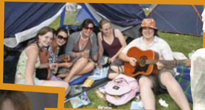
BELOW: The Feeling