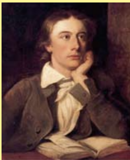
John Keats, who penned some of his finest poetry while staying in Shanklin