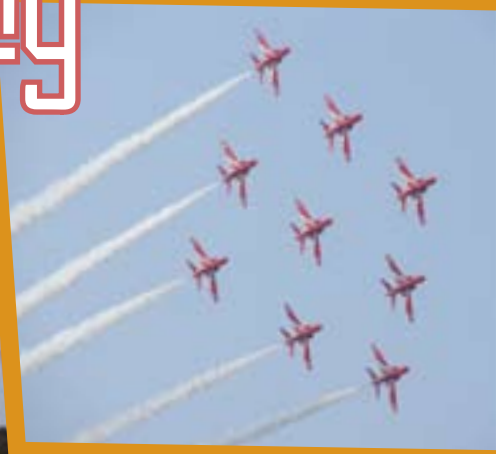
ABOVE: The Red Arrows entertained the crowds on Saturday afternoon