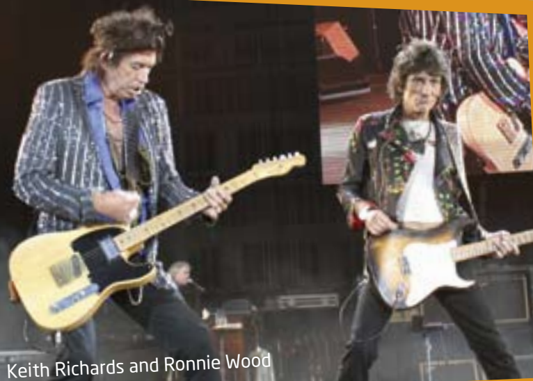
Keith Richards and Ronnie Wood