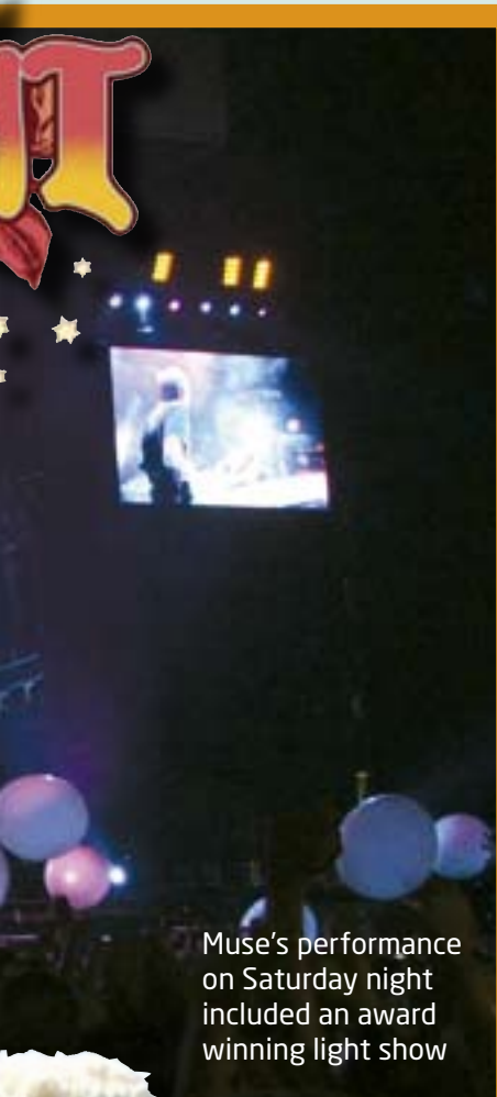
Muse's performance on Saturday night included an award winning light show

"I was absolutely delighted with this year's event. I think it was our best festival so far. To have been able to bring to the Island such a high quality line-up, headlined of course by the Rolling Stones, shows just how far the festival has come and how highly regarded it is within the international music scene."