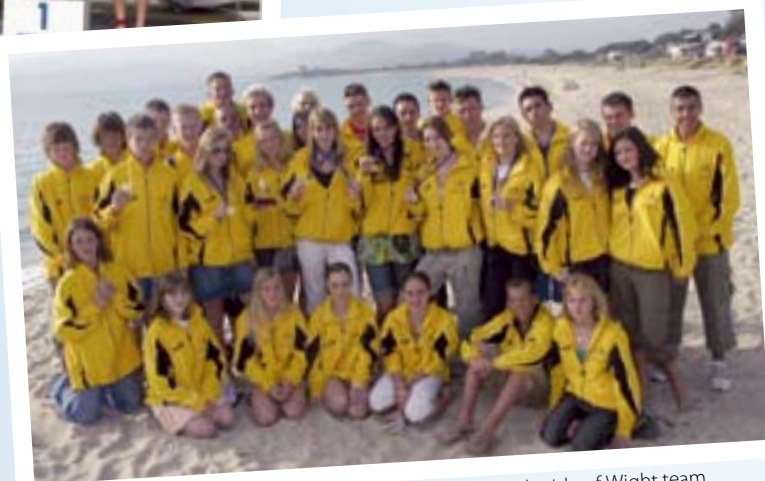
ABOVE: The Isle of Wight team