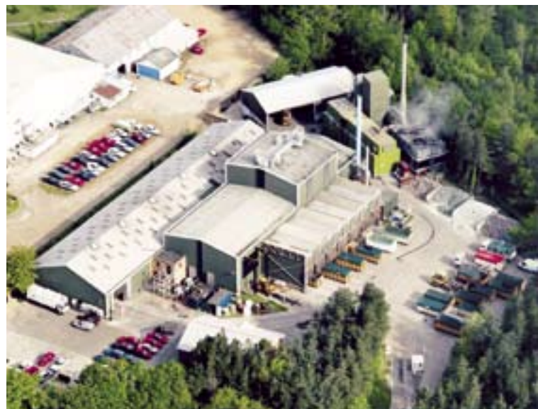
The Forest Park site for the new gasification plant

• There are currently six similar ENERGOS plants operating in Norway and Germany and the technology has a ten year track record with more than 280,000 hours of operating experience. The compact design of these facilities means they can be sited near the communities they serve and can convert non-recyclable waste into useful energy.