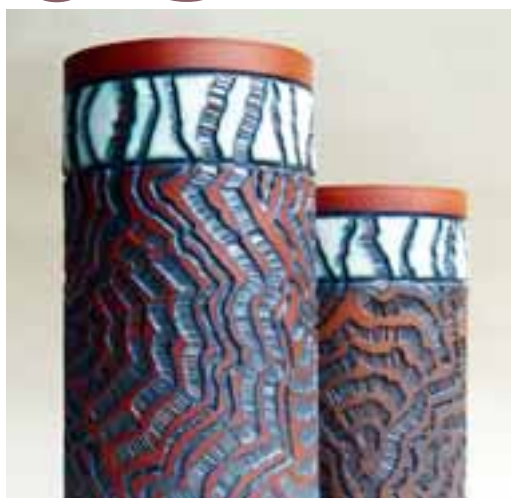
Andrew Dowden Ceramic Designs, an exhibition at 29 Ventnor Road, Apse Heath from 18 to 21 July, see listing for times

(27 July) Come and support your local RSPCA animal centre, at Bohemia Corner, Merstone Lane, Godshill, dog show, dog agility, many stalls, refreshments, 11am to 4pm, £2.50 adults, children free.