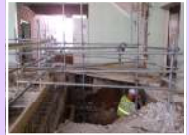
New pipework is installed