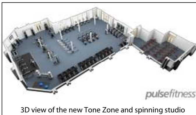
3D view of the new Tone Zone and spinning studio

We're planning to open the new state-of-the-art Tone Zone and spinning studio on Monday 24 September to give One Card members a sneak preview ahead of the public. We'd also like to use this time to make sure all our members undertake a short induction on the new equipment to get the maximum benefit and so that staff can show you how each piece works.