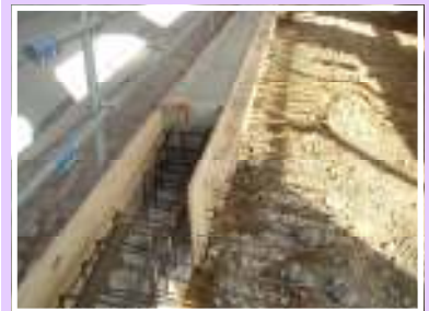
Reinforcing for the pool's new perimeter deck area