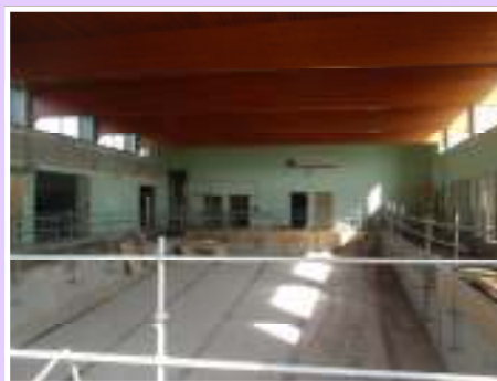
A view you won't often see!