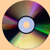
CDs and DVDs