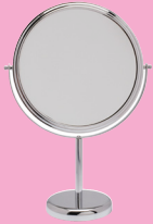
Glass cookware/ mirrors.