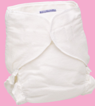
Nappies/ sanitary items/ textiles.