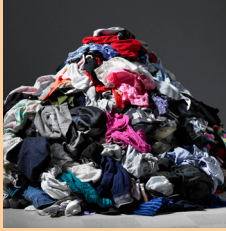
Old clothing/ shoes/ handbags.