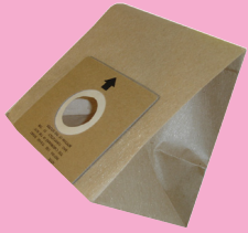
Vacuum cleaner bags.