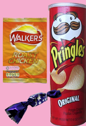
Sweet wrappers/ crisp packets/ Pringles tubes.