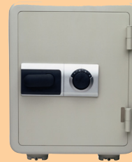
Large metal items.