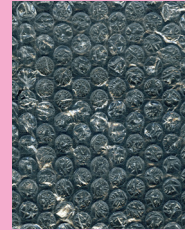
Cling film/ bubble wrap.