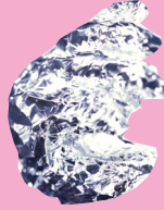
Paper/foil contaminated with food.