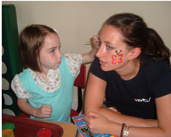
the activities were recorded by the young people's photography.

Various trips were made to Robin Hill and the Spinnaker Tower and all